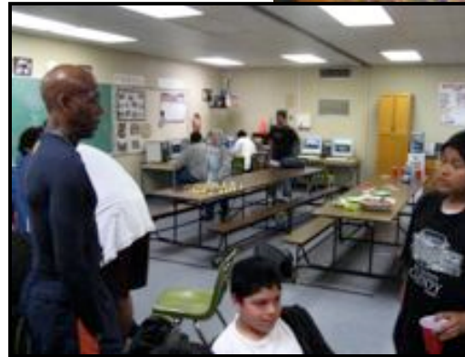
St Francis Assisi Boys Club