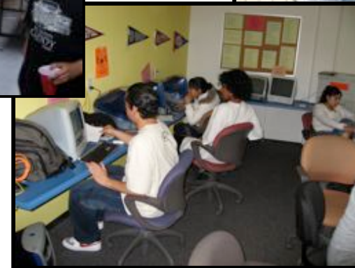
Foundation for College Education