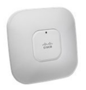
Figure 2 Cisco Aironet 1140 Series Access Point