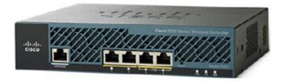
Figure 7 Cisco Air 2504 Wireless Local Area Network (LAN) Controller

Projects will also require either hardware or software to manage the network, as well as a router to provide a firewall and routing connection to the bandwidth source. Such equipment may include the items illustrated in Figures 7-8.