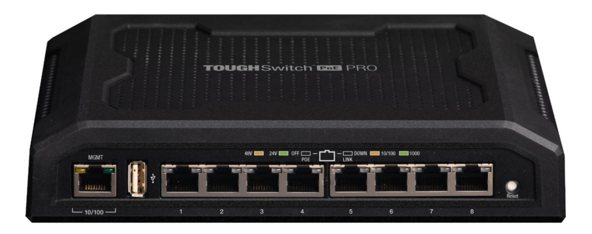
Figure 6 Ubiquiti 8 Port TOUGHSWITCH POE PRO

Projects will also require either hardware or software to manage the network, as well as a router to provide a firewall and routing connection to the bandwidth source. Such equipment may include the items illustrated in Figures 7-8.