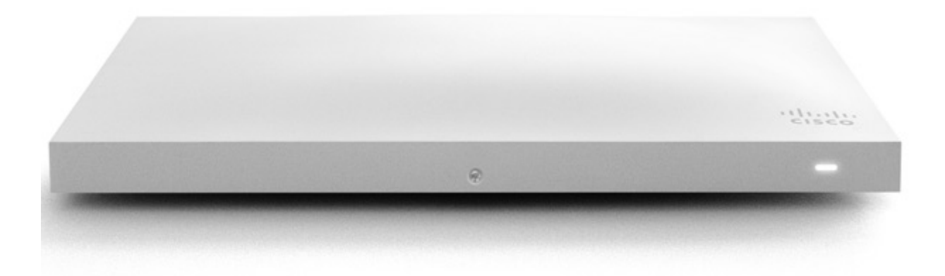
Figure 4 Cisco Meraki MR34Indoor Cloud Managed Access Point

Projects will also require a concentrator/switch, such as those illustrated in Figures 5-6. Enterprise class access points are powered through the Ethernet cable that connects the access points to the concentrator/switch with powers the access points and aggregates them for connection at a single Internet connection.