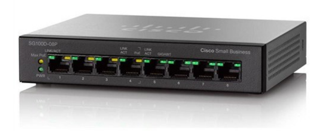
Figure 5 Cisco Systems 8-Port Gigabit (SG100D-08P-NA)

Projects will also require a concentrator/switch, such as those illustrated in Figures 5-6. Enterprise class access points are powered through the Ethernet cable that connects the access points to the concentrator/switch with powers the access points and aggregates them for connection at a single Internet connection.