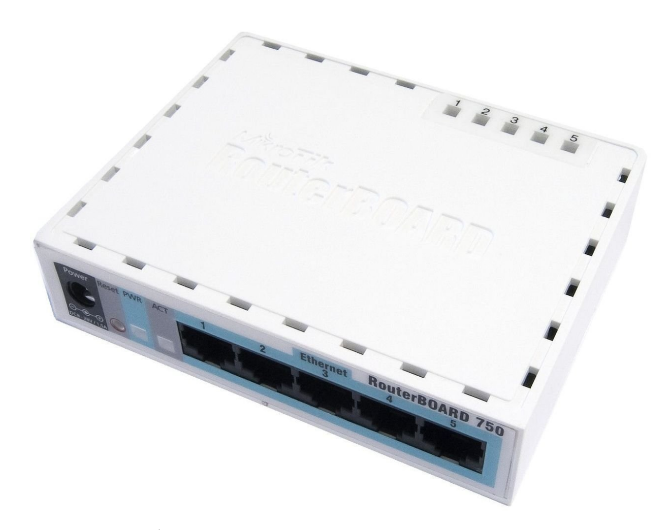
Figure 8 Microtik RB/750UP Mini-Router

Ken Biba of Novarum provided the following three estimates. Novarum provides strategic consulting and analysis for the wireless broadband data industry, focusing on the key technologies of Wi-Fi, WiMAX and 3G cellular data.