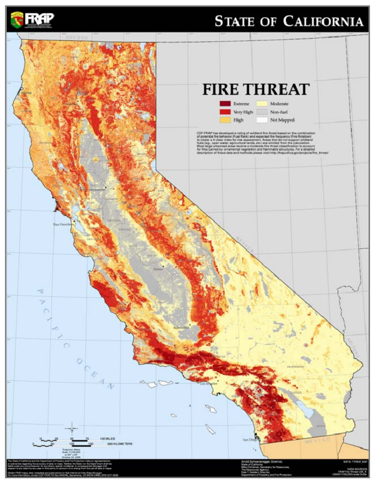
(END OF APPENDIX C)