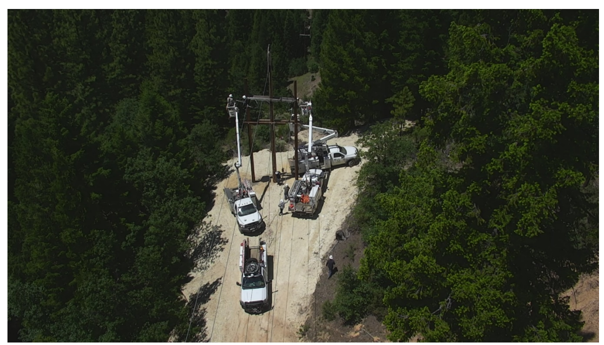
This image illustrates the dense forest and rough terrain of the Long Valley – Spring Garden area.