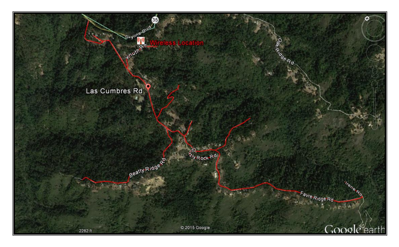
Figure 2: Map of Project with Route Detail

The project is located in a remote area in the Santa Cruz Mountains above Los Gatos. This has traditionally been an underserved area due to the difficulty of the terrain and the excessively high cost of providing wireline services.