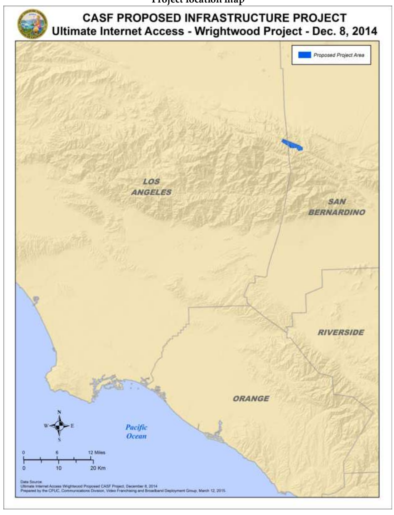
Appendix B Resolution T-17475 UIA Wrightwood Project location map