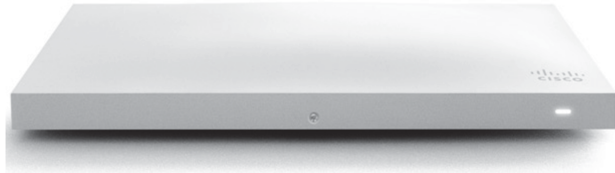
Figure 4 Cisco Meraki MR34 Indoor Cloud Managed Access Point

Projects will also require a concentrator/switch, such as those illustrated in Figures 5-6. Enterprise class access points are powered through the Ethernet cable that connects the access points to the concentrator/switch with powers the access points and aggregates them for connection at a single Internet connection.