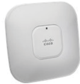
Figure 2 Cisco Aironet 1140 Series Access Point