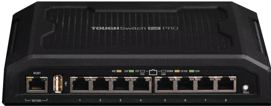
Figure 6 Ubiquiti 8 Port TOUGH SWITCH POE PRO

Projects will also require either hardware or software to manage the network, as well as a router to provide a firewall and routing connection to the bandwidth source. Such equipment may include the items illustrated in Figures 7-8.