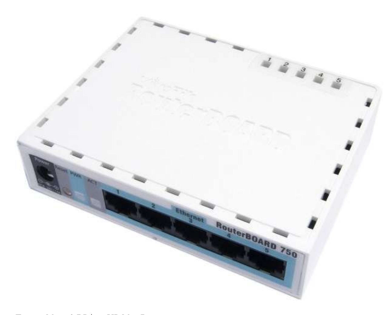
Figure 8 Microtik RB/750UP Mini-Router

Ken Biba of Novarum provided the following three estimates. Novarum provides strategic consulting and analysis for the wireless broadband data industry, focusing on the key technologies of Wi-Fi, WiMAX and 3G cellular data.