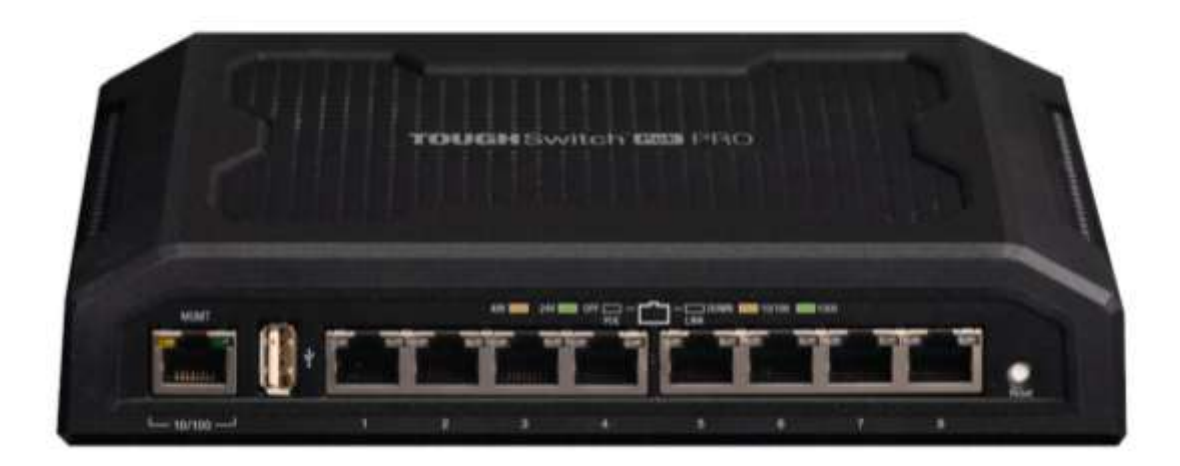
Figure 6 Ubiquiti 8 Port TOUGHSWITCH POE PRO

Projects will also require either hardware or software to manage the network, as well as a router to provide a firewall and routing connection to the bandwidth source. Such equipment may include the items illustrated in Figures 7-8.