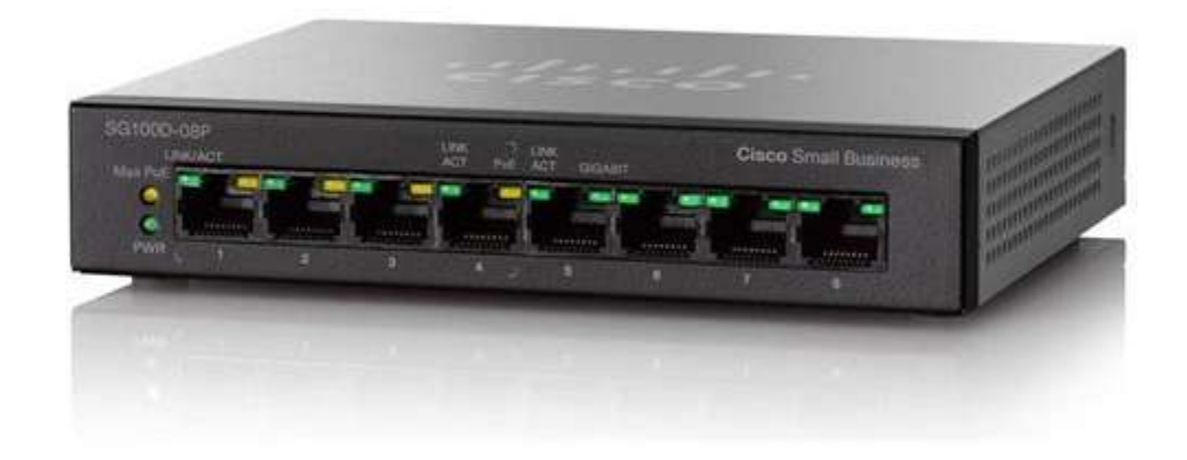
Figure 5 Cisco Systems 8-Port Gigabit (SG100D-08P-NA)

Projects will also require a concentrator/switch, such as those illustrated in Figures 5-6. Enterprise class access points are powered through the Ethernet cable that connects the access points to the concentrator/switch with powers the access points and aggregates them for connection at a single Internet connection.