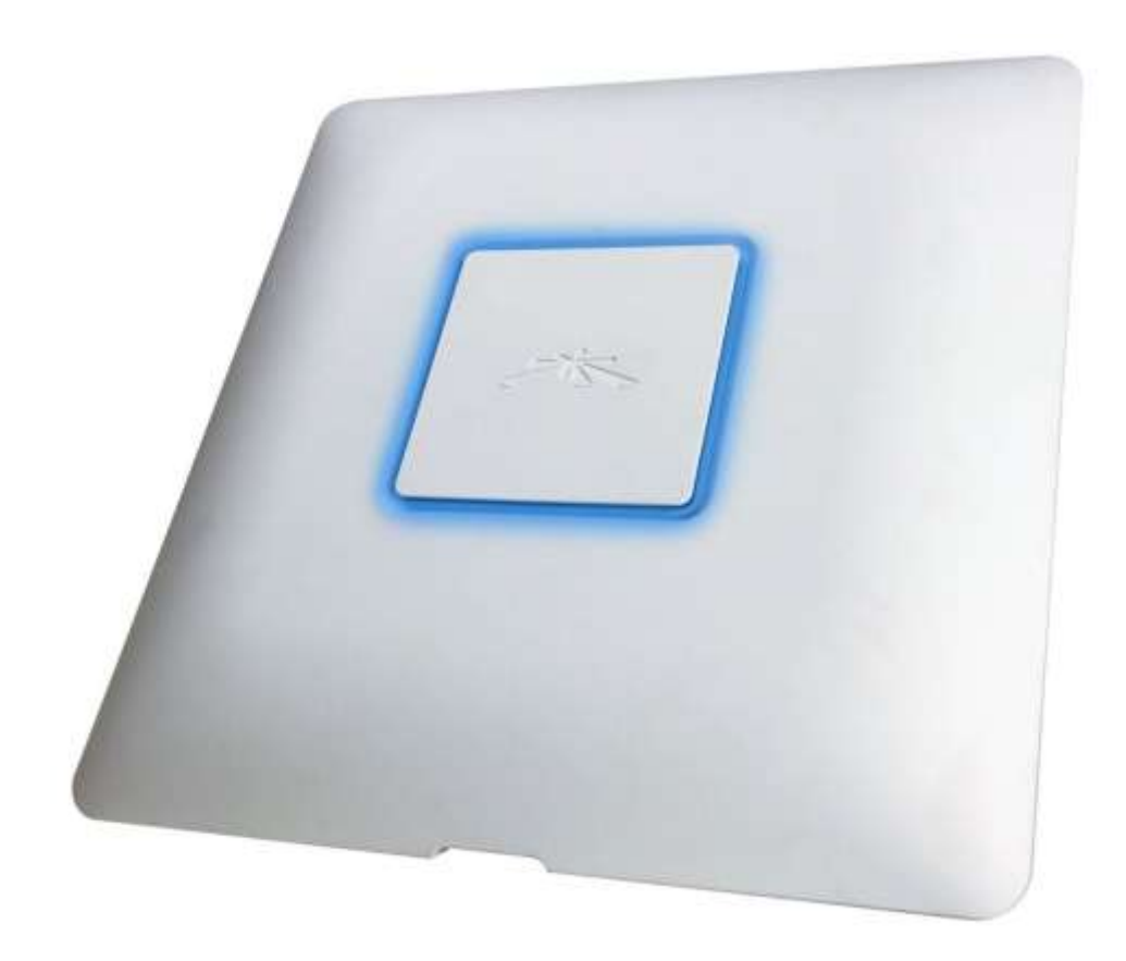
Figure 3 Ubiquiti Networks UniFi AC Enterprise WiFi System- UAP-AC