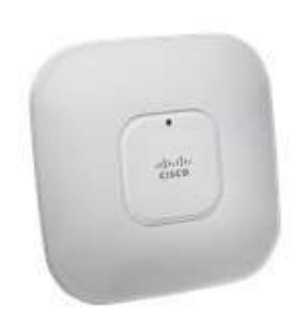
Figure 2 Cisco Aironet 1140 Series Access Point