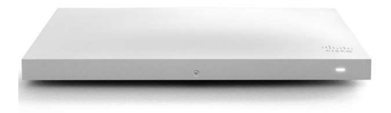
Figure 4 Cisco Meraki MR34Indoor Cloud Managed Access Point

Projects will also require a concentrator/switch, such as those illustrated in Figures 5-6. Enterprise class access points are powered through the Ethernet cable that connects the access points to the concentrator/switch with powers the access points and aggregates them for connection at a single Internet connection.