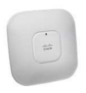
Figure 2 Cisco Aironet 1140 Series Access Point