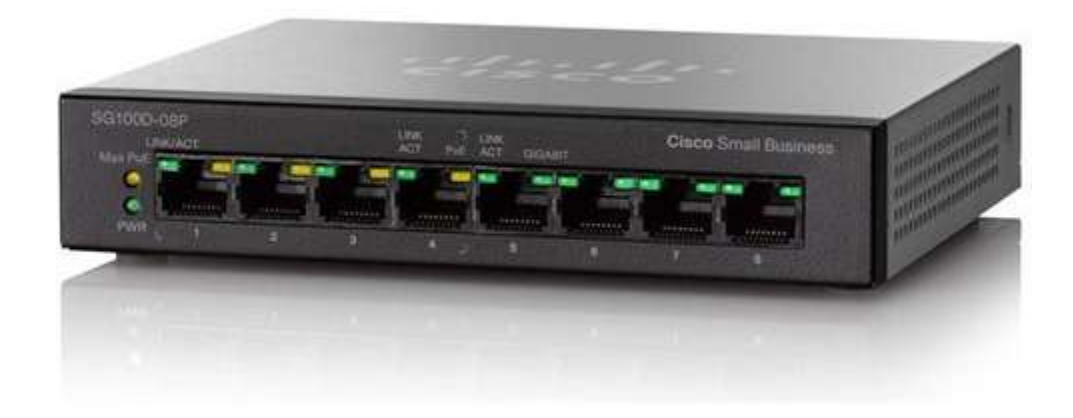
Figure 5 Cisco Systems 8-Port Gigabit (SG100D-08P-NA)

Projects will also require a concentrator/switch, such as those illustrated in Figures 5-6. Enterprise class access points are powered through the Ethernet cable that connects the access points to the concentrator/switch with powers the access points and aggregates them for connection at a single Internet connection.