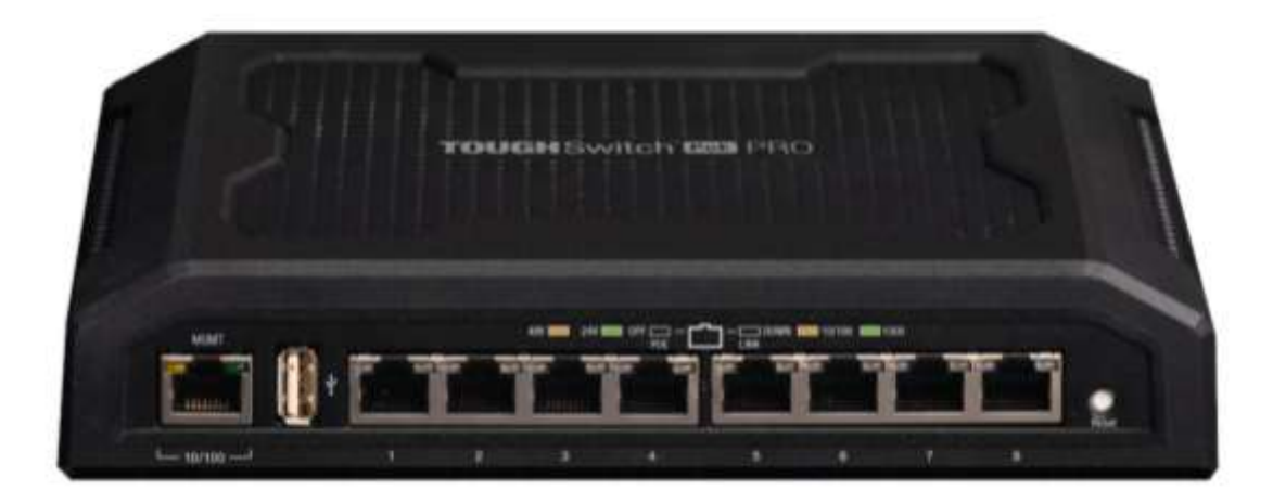
Figure 6 Ubiquiti 8 Port TOUGHSWITCH POE PRO

Projects will also require either hardware or software to manage the network, as well as a router to provide a firewall and routing connection to the bandwidth source. Such equipment may include the items illustrated in Figures 7-8.