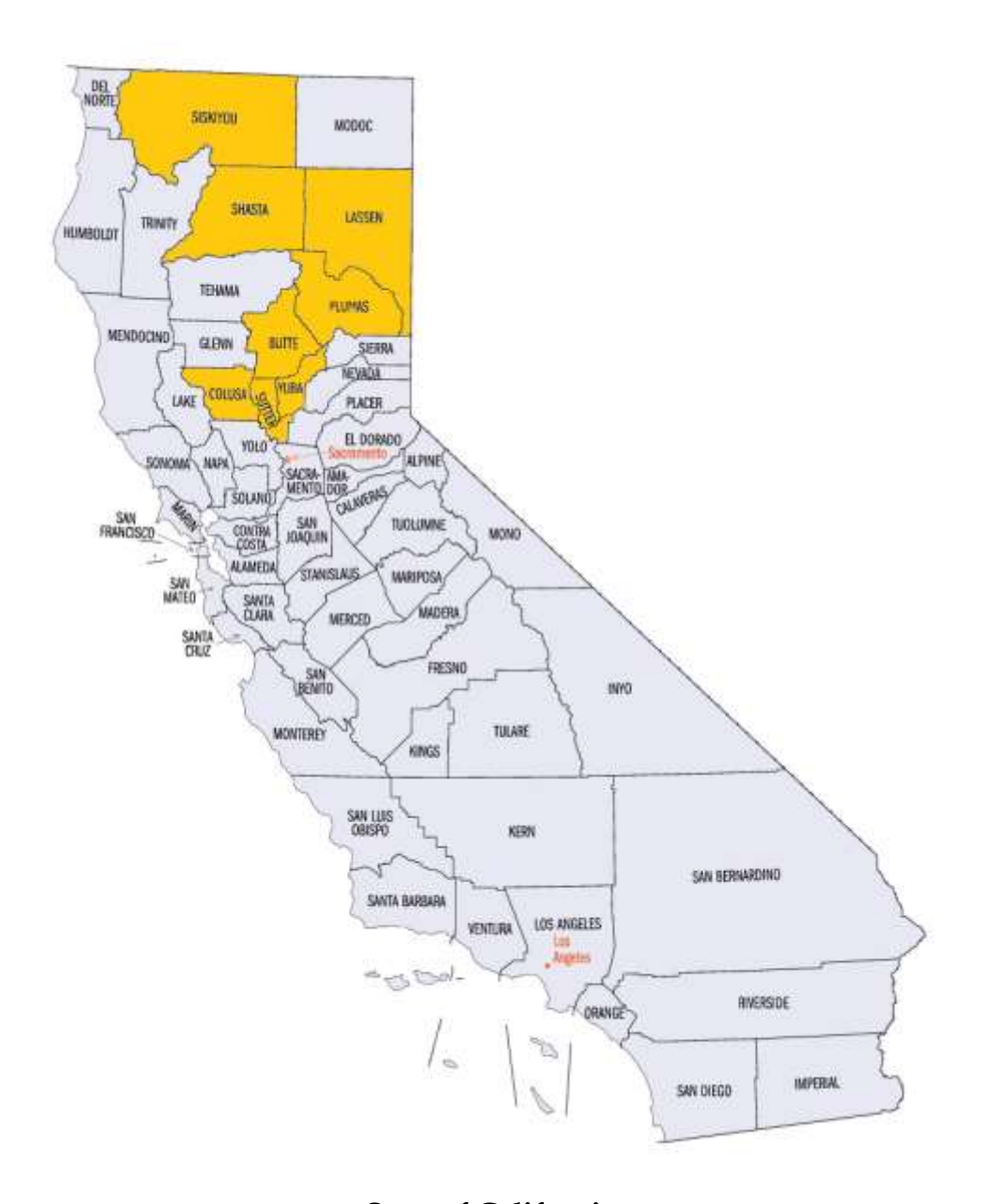
State of California No. Counties affected: 8 of 58 Population Affected: 30,000 As Percentage of Total State Population: 0.08%