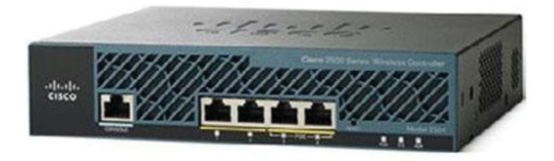
Figure 7 Cisco Air 2504 Wireless Local Area Network (LAN) Controller

Projects will also require either hardware or software to manage the network, as well as a router to provide a firewall and routing connection to the bandwidth source. Such equipment may include the items illustrated in Figures 7-8.