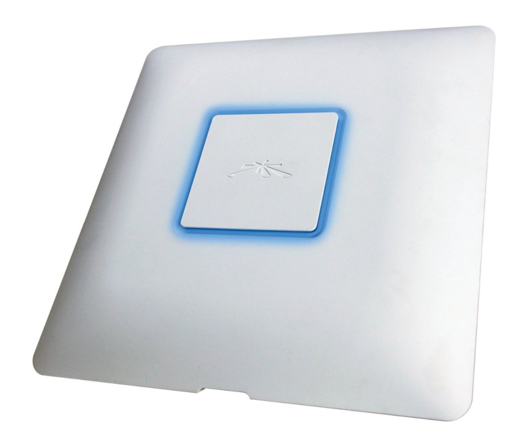
Figure 3 Ubiquiti Networks UniFi AC Enterprise WiFi System- UAP-AC