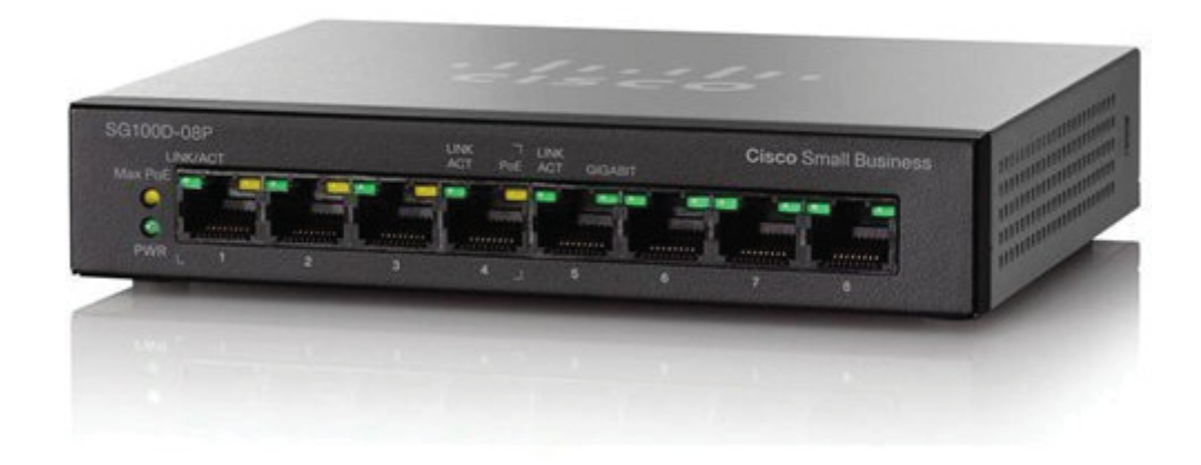
Figure 5 Cisco Systems 8-Port Gigabit (SG100D-08P-NA)

Projects will also require a concentrator/switch, such as those illustrated in Figures 5-6. Enterprise class access points are powered through the Ethernet cable that connects the access points to the concentrator/switch with powers the access points and aggregates them for connection at a single Internet connection.