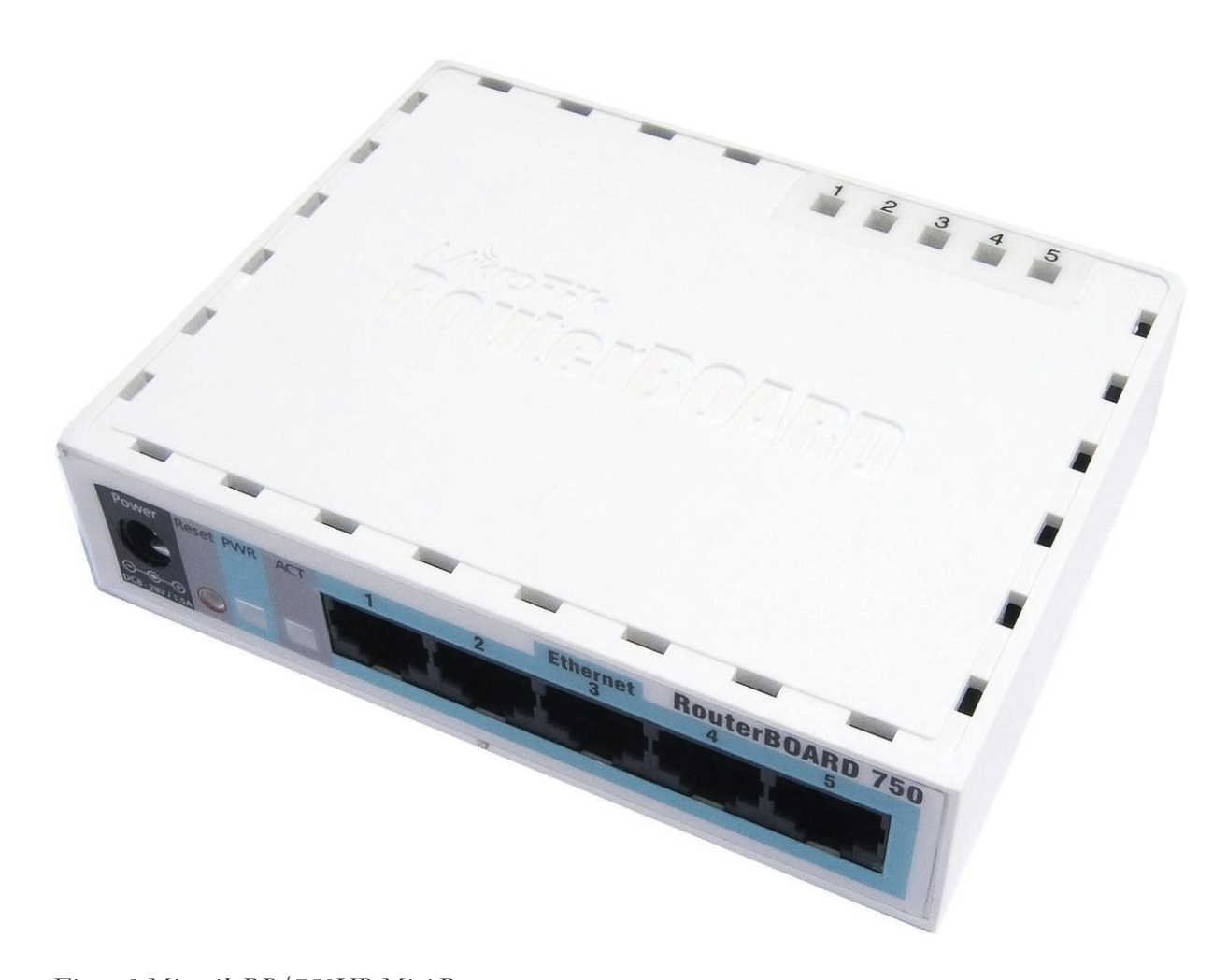
Figure 8 Microtik RB/750UP Mini-Router

Ken Biba of Novarum provided the following three estimates. Novarum provides strategic consulting and analysis for the wireless broadband data industry, focusing on the key technologies of Wi-Fi, WiMAX and 3G cellular data.