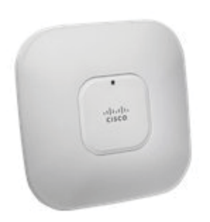
Figure 2 Cisco Aironet 1140 Series Access Point