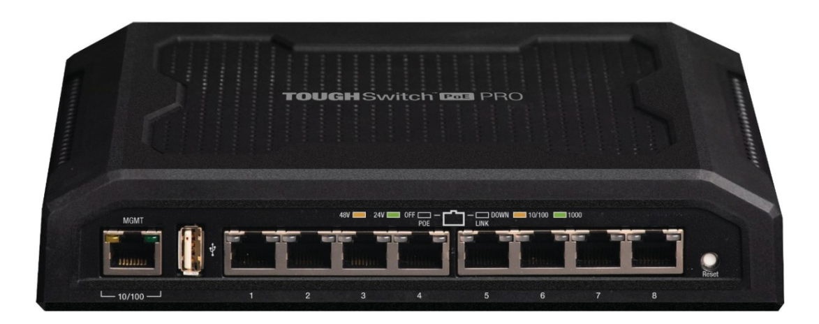
Figure 6 Ubiquiti 8 Port TOUGHSWITCH POE PRO

Projects will also require either hardware or software to manage the network, as well as a router to provide a firewall and routing connection to the bandwidth source. Such equipment may include the items illustrated in Figures 7-8.