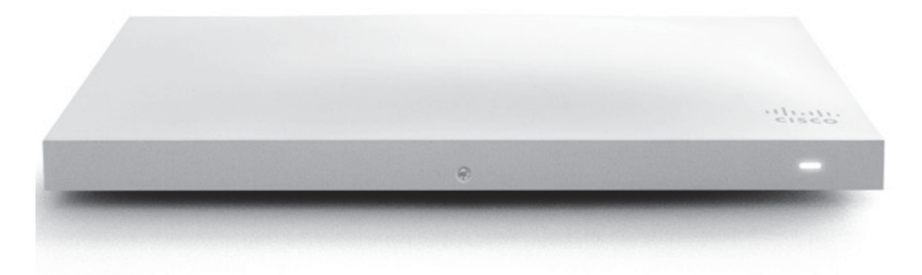
Figure 4 Cisco Meraki MR34Indoor Cloud Managed Access Point

Projects will also require a concentrator/switch, such as those illustrated in Figures 5-6. Enterprise class access points are powered through the Ethernet cable that connects the access points to the concentrator/switch with powers the access points and aggregates them for connection at a single Internet connection.