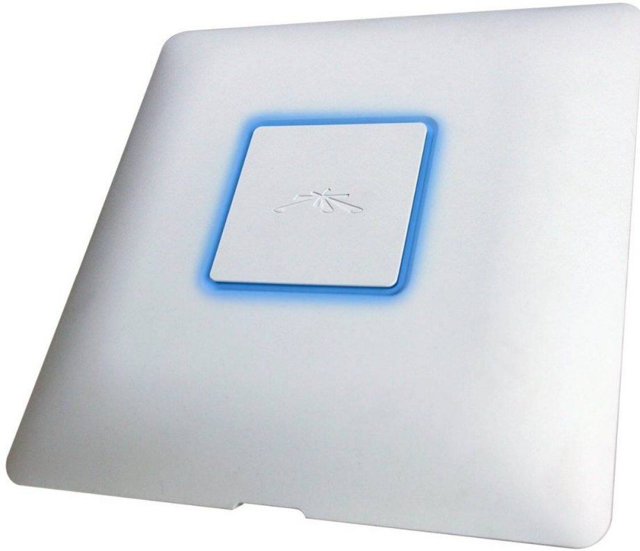
Figure 3 Ubiquiti Networks UniFi AC Enterprise WiFi System- UAP-AC