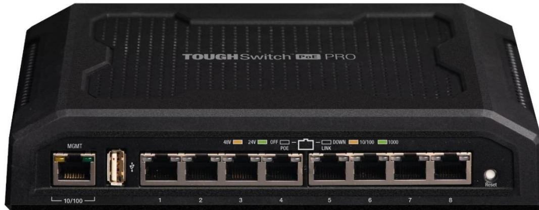
Figure 6 Ubiquiti 8 Port TOUGH SWITCH POE PRO

Projects will also require either hardware or software to manage the network, as well as a router to provide a firewall and routing connection to the bandwidth source. Such equipment may include the items illustrated in Figures 7-8.