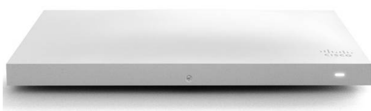
Figure 4 Cisco Meraki MR34 Indoor Cloud Managed Access Point

Projects will also require a concentrator/switch, such as those illustrated in Figures 5-6. Enterprise class access points are powered through the Ethernet cable that connects the access points to the concentrator/switch with powers the access points and aggregates them for connection at a single Internet connection.