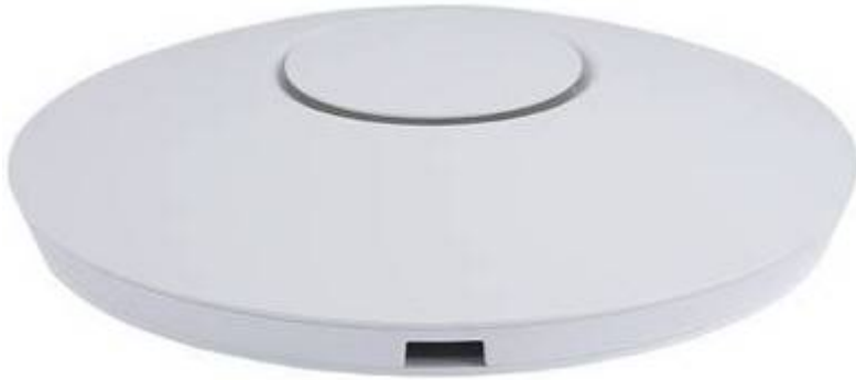
Figure 1 Ubiquiti Networks UniFi UAP-Pro Enterprise Wi-Fi System